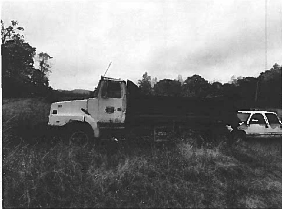
1997 Volvo Dump Truck (303) VIN# D 4VHJCBME3VR856718