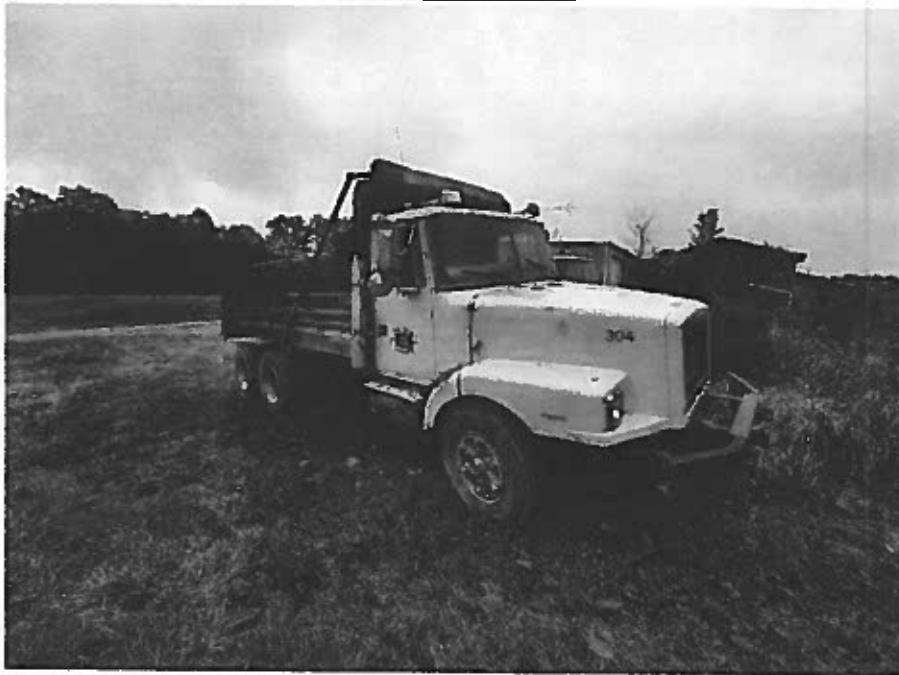
1997 Volvo Dump Truck (304) D 4VHJCBME1VR856717